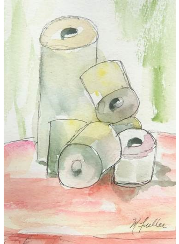
White Gold in the Pandemic

I've been trying to get updates on community services and policies, as well as, working with some of our City and County workers to address the challenges facing our community during this time. I have seen how dire this situation is for our low-income community members. Domestic violence has increased in frequency and severity, and my clients with behavioral health challenges are seeing their symptoms exacerbated. However, if there is a silver lining in all of this, I am seeing how our community has come together and responded on multiple levels. We're all in this together, and here in Boulder County, we're responding together.