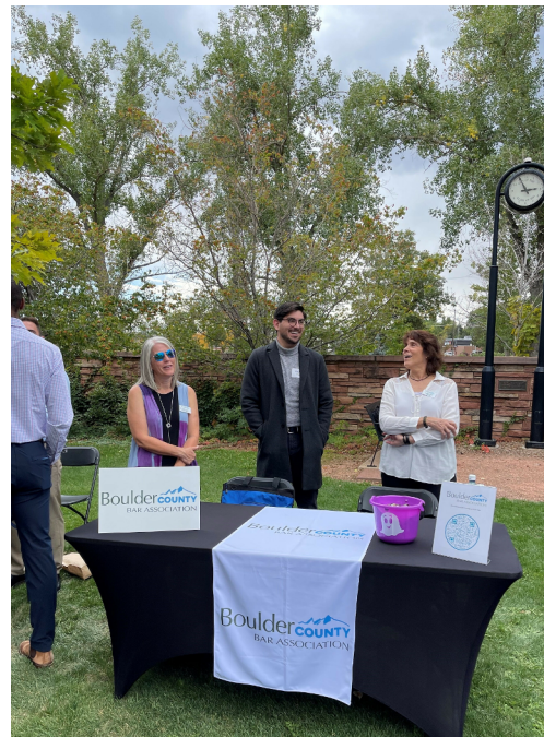
BCBA at Colorado Legal Community Fair