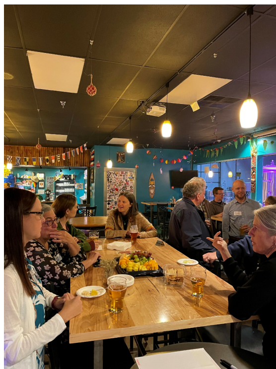
BCBA Longmont Happy Hour