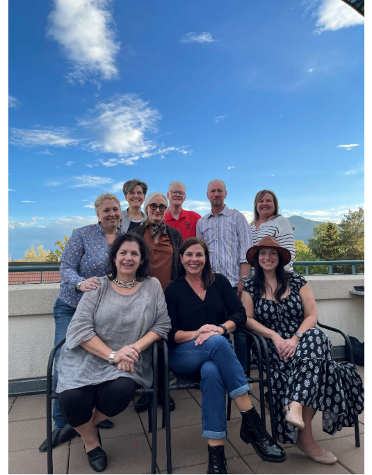
National Association of Bar Executives Board of Directors at the BCBA