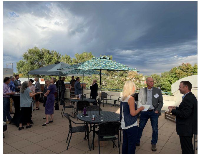
Boulder County Estate Planning Council at the BCBA