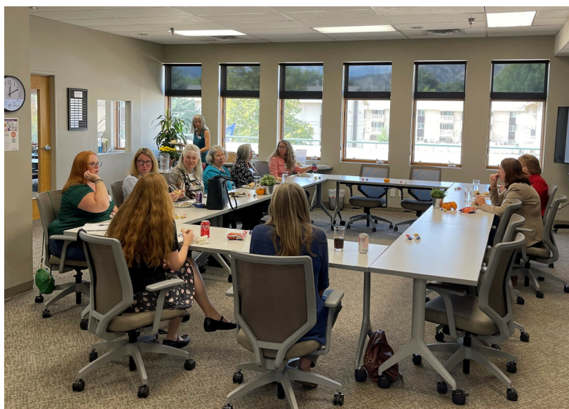
BCBA Paralegal Lunch