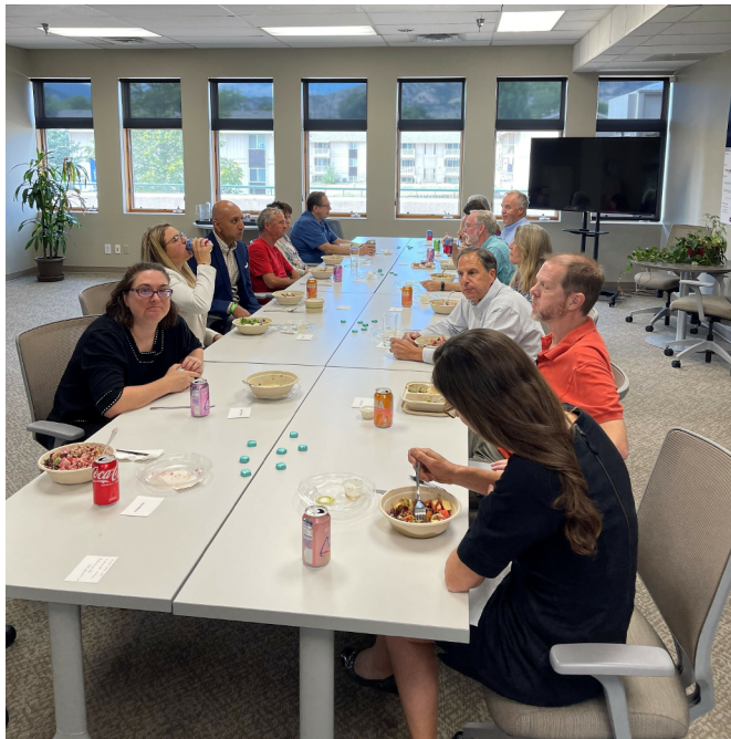
BCBA Membership Lunch