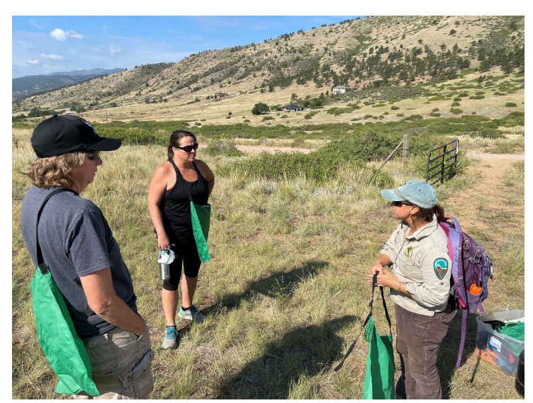
July BCBA Volunteer Project with Boulder County Open Space - Native Seed Collection