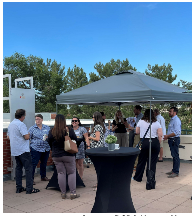
August BCBA Happy Hour