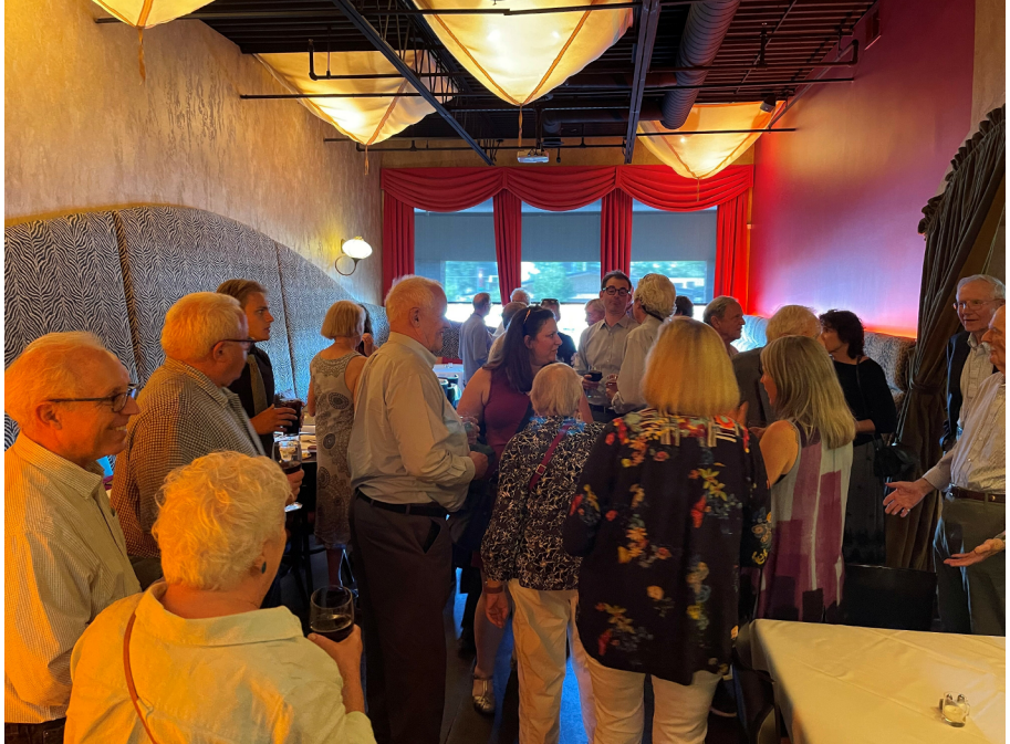
BCBA Past Presidents' Dinner at Carelli's