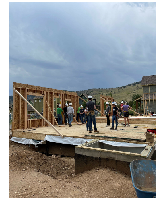
BCBA at Habitat for Humanity