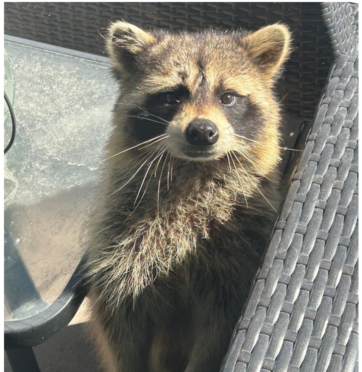
A raccoon visits the BCBA front patio