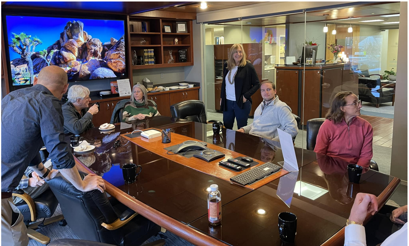
Wednesday Bagels with the Bar: Longmont edition at Lyons Gaddis