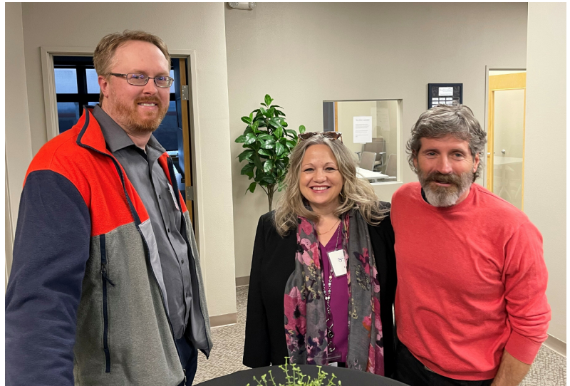
CBA Presidential Visit to the BCBA