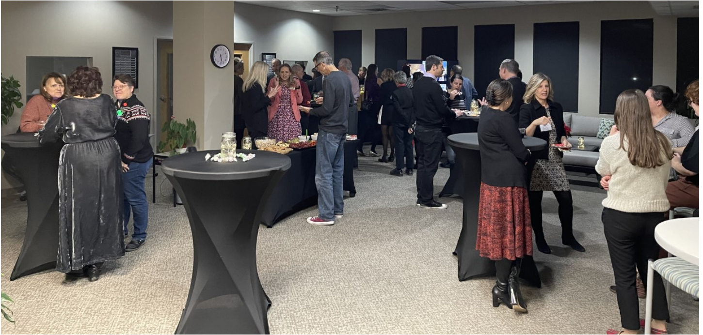
BCBA Holiday Party