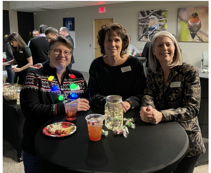
BCBA Holiday Party