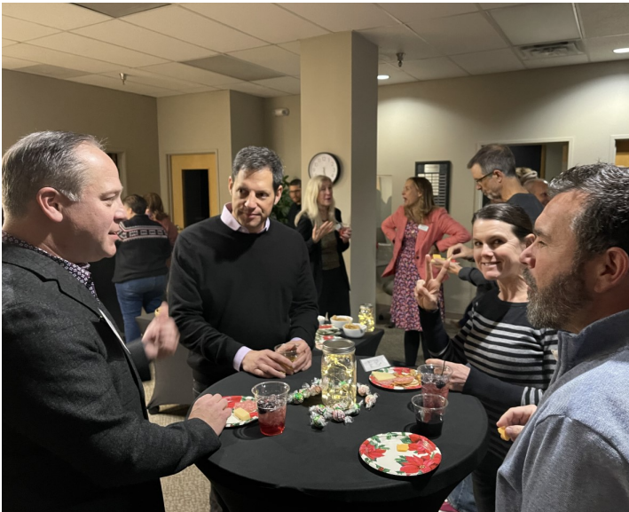
BCBA Holiday Party