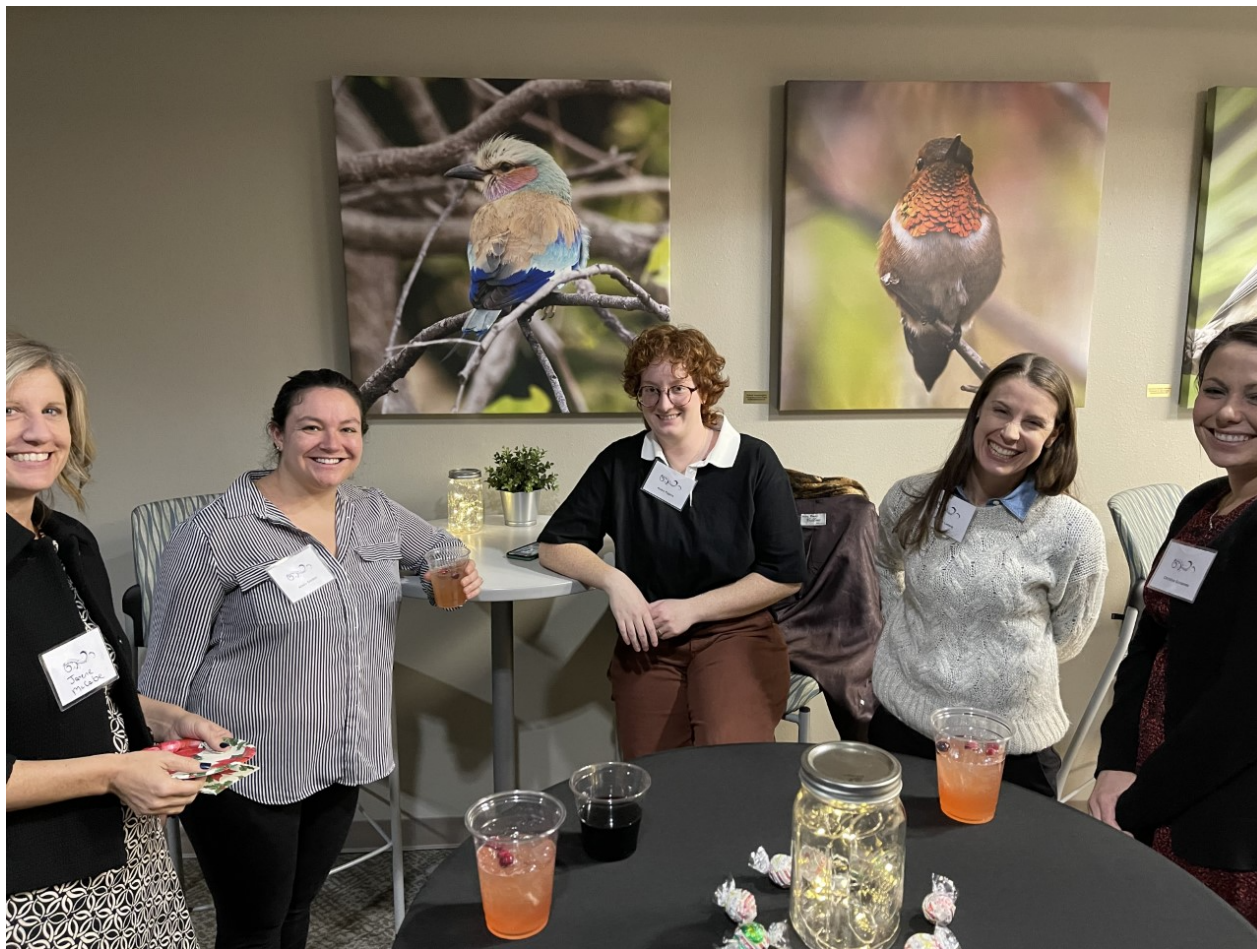
BCBA Holiday Party