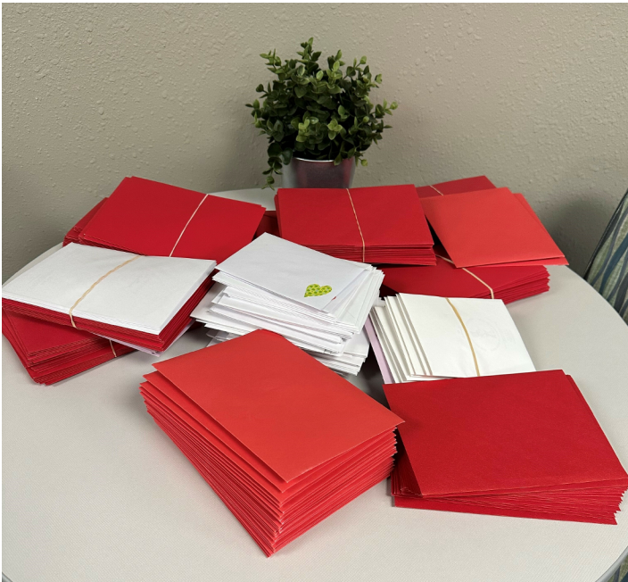
Paralegal Valentine's Day Cards for Seniors Project