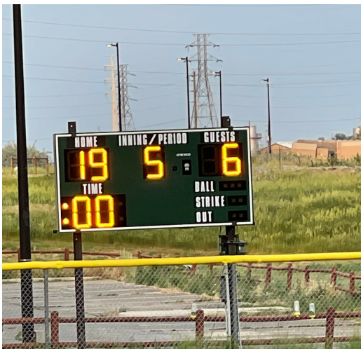
TRUTH BADER WINSBURG 19 BAD NEWS BARRISTERS 6