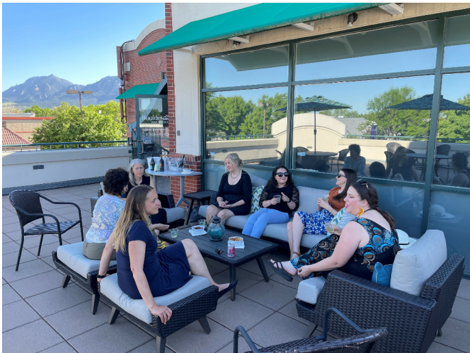
JUNE BOARD OF DIRECTORS DINNER