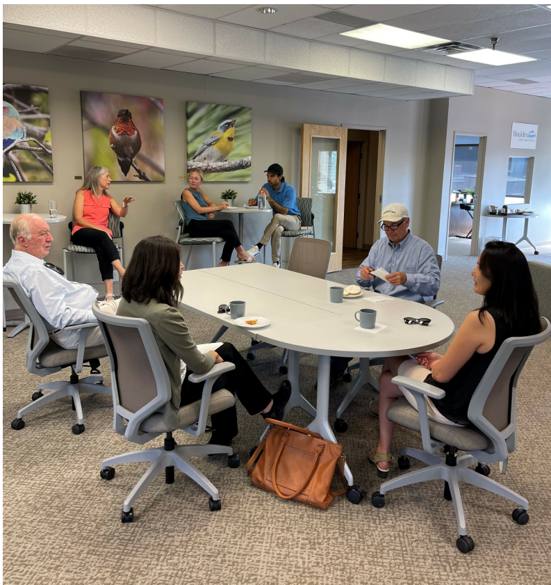
BAGELS WITH THE BAR – EVERY WEDNESDAY AT THE BCBA OFFICE (8-10 AM)