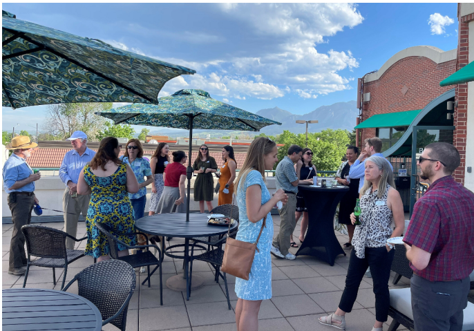
JUNE BCBA HAPPY HOUR