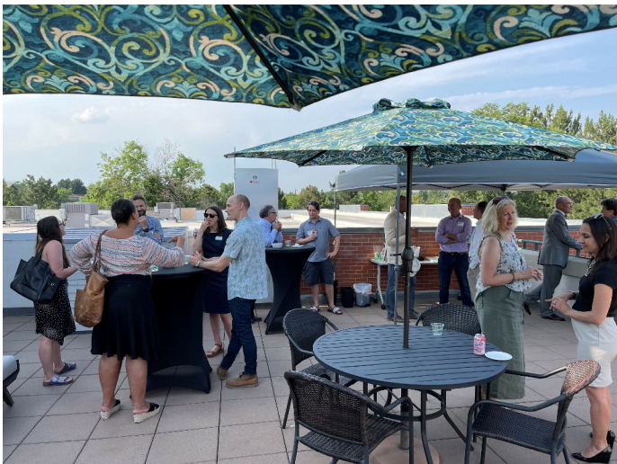
JULY BCBA HAPPY HOUR