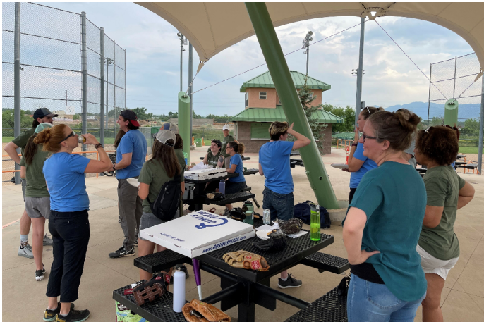
SOFTBALL SHOWDOWN – TRUTH BADER WINSBURG & BAD NEWS BARRISTERS