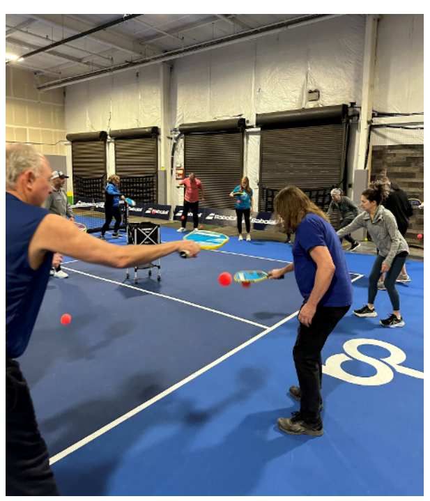
BCBA Pickleball Night