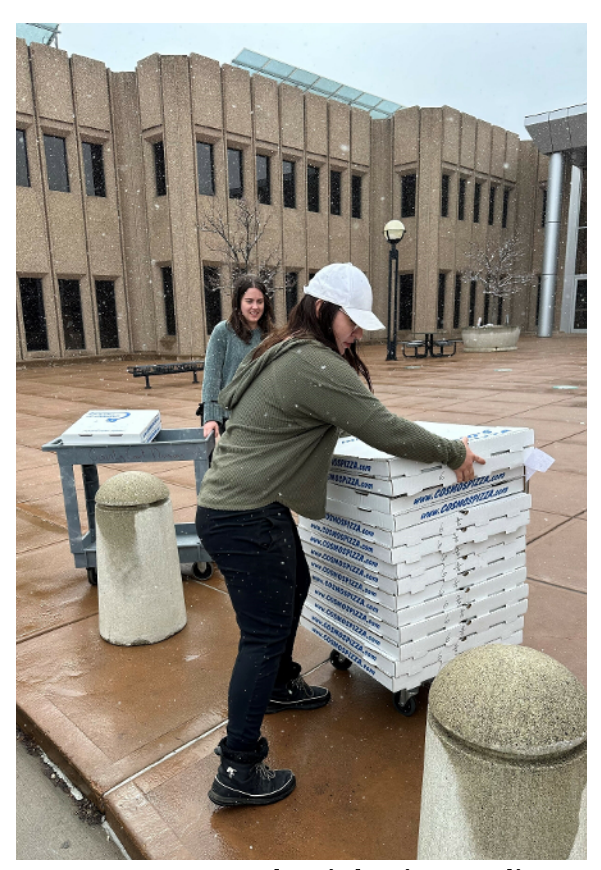
2024 Mock Trials Pizza Delivery