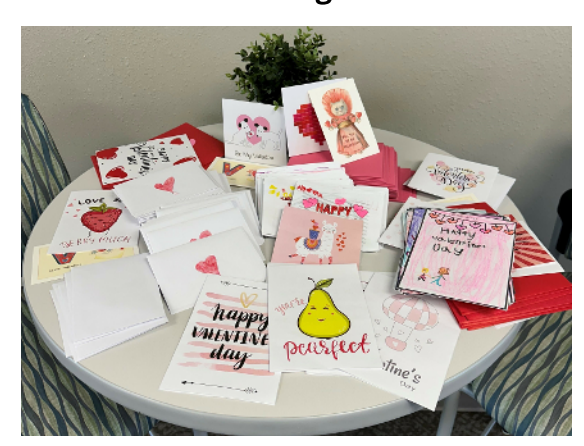
Our 2024 Valentines to be distributed