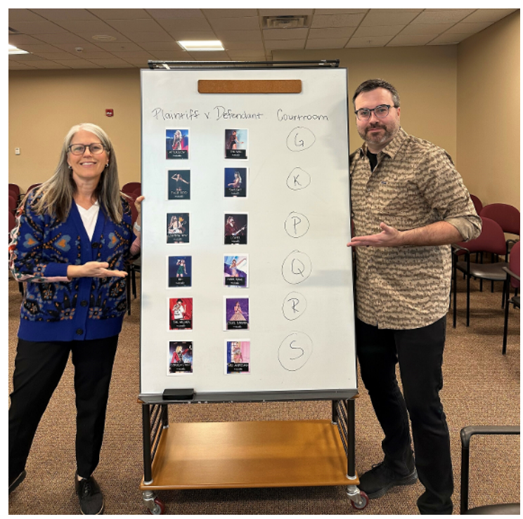
2024 Boulder County Mock Trials