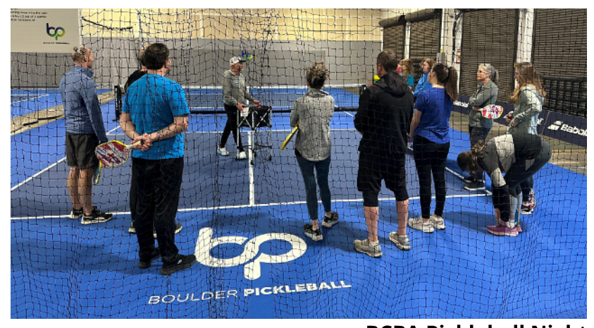
BCBA Pickleball Night Special thanks to our event sponsor Berg Hill Greenleaf Ruscitti LLP