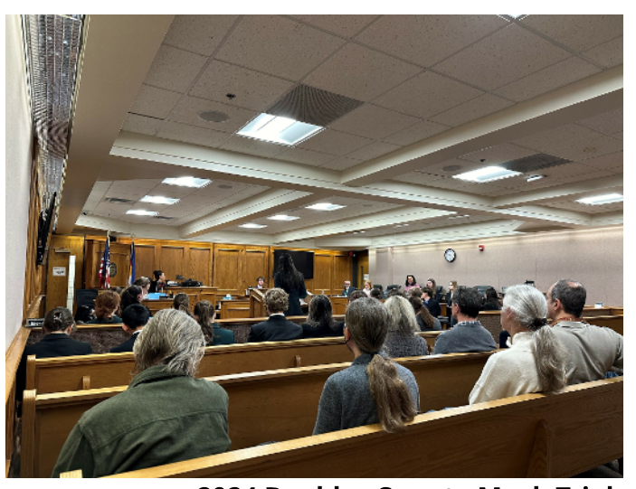
2024 Boulder County Mock Trials