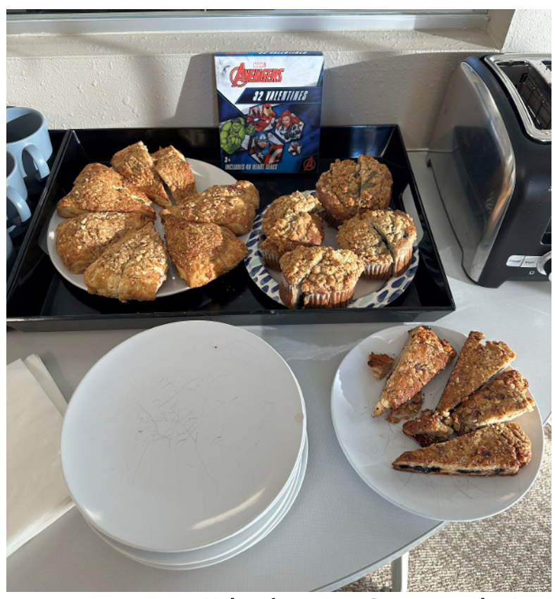
Valentine's Day Scones at the Bar!