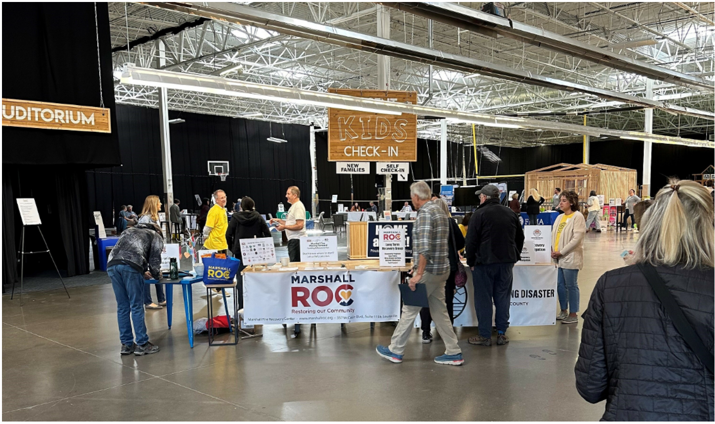
The BCBA at the Marshall ROC Marshall Fire Recovery Event