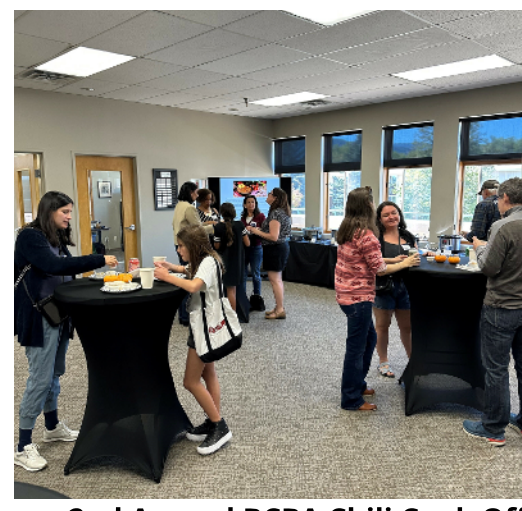
2nd Annual BCBA Chili Cook Off