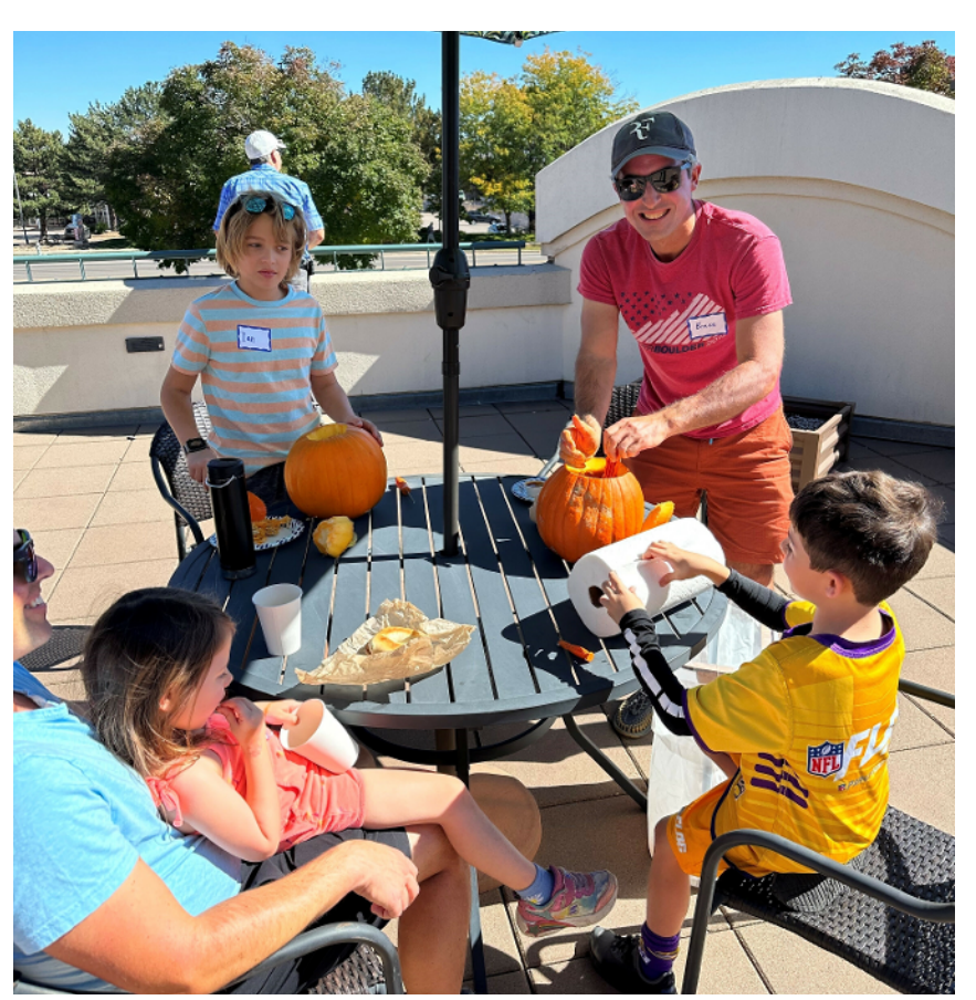
2nd Annual BCBA Chili Cook Off