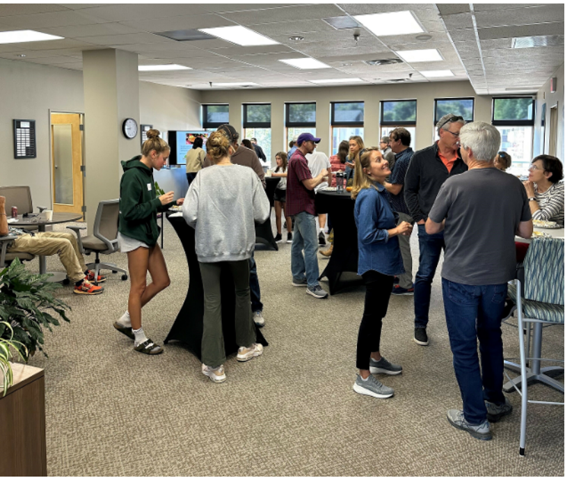
2nd Annual BCBA Chili Cook Off