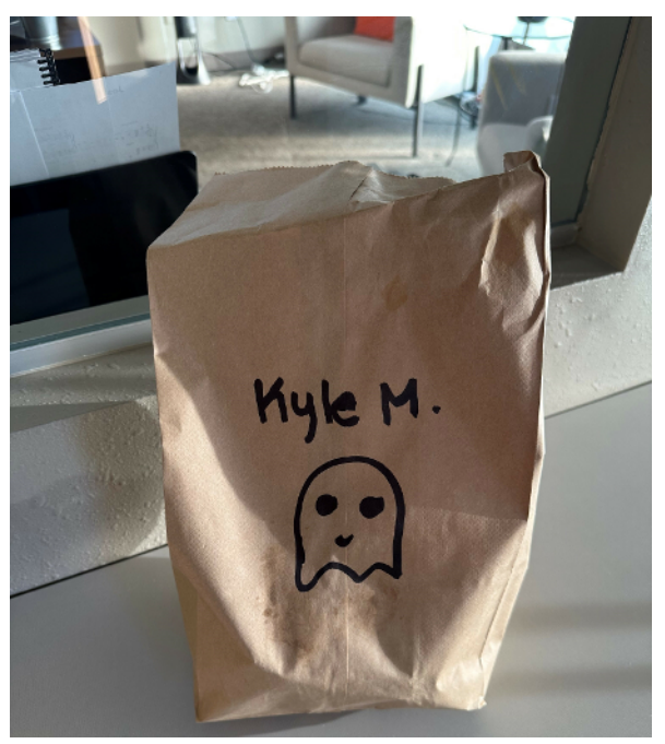
A spooky Bagels with the Bar