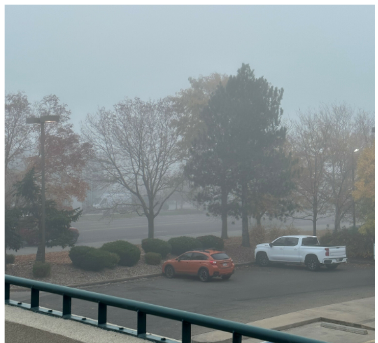
A foggy Bagels with the Bar