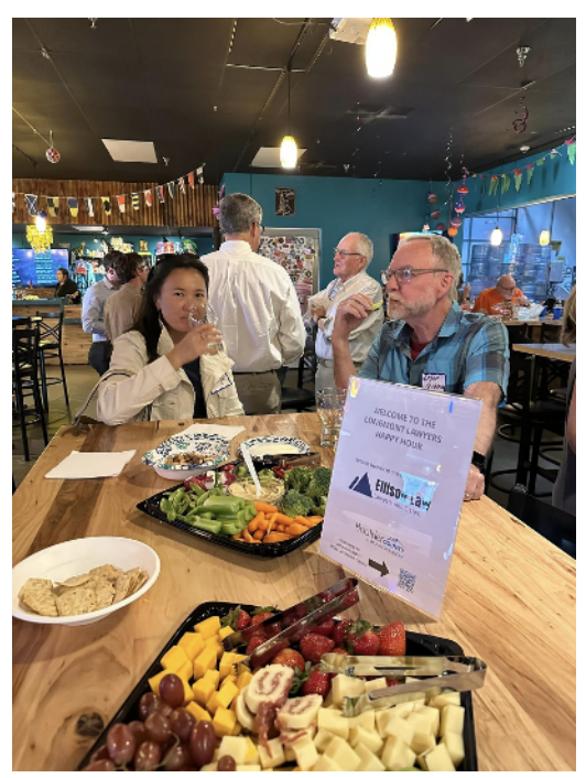
Longmont Lawyers Happy Hour Sponsored by Ellison Law