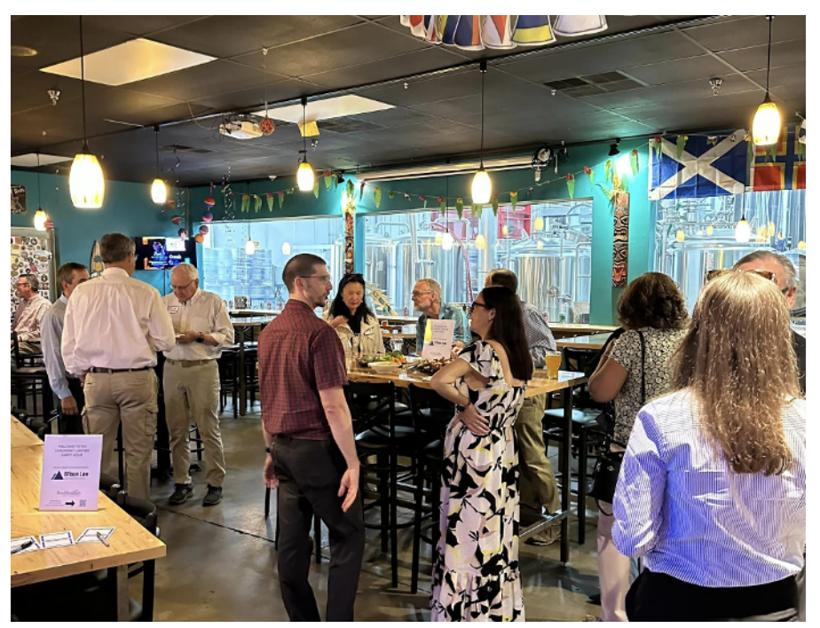
Longmont Lawyers Happy Hour Sponsored by Ellison Law