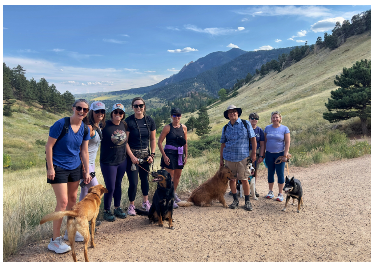
BCBA & CWBA Joint Hike