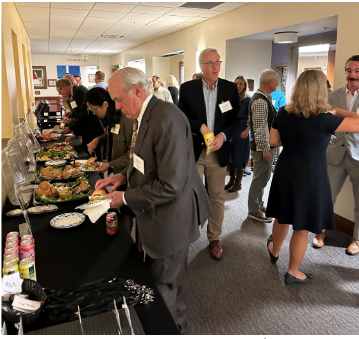
2023 Bench Bar Retreat