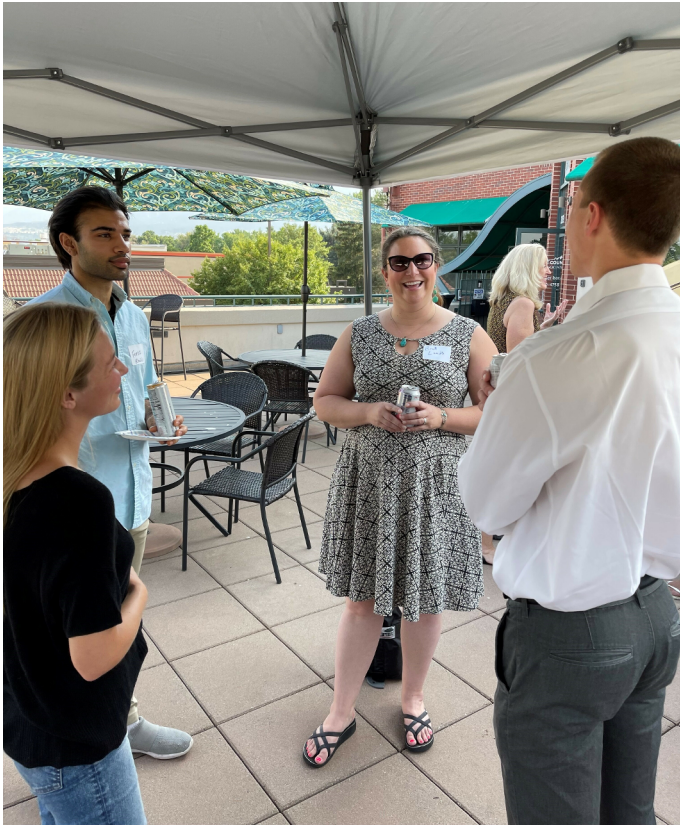
BCBA AUGUST HAPPY HOUR