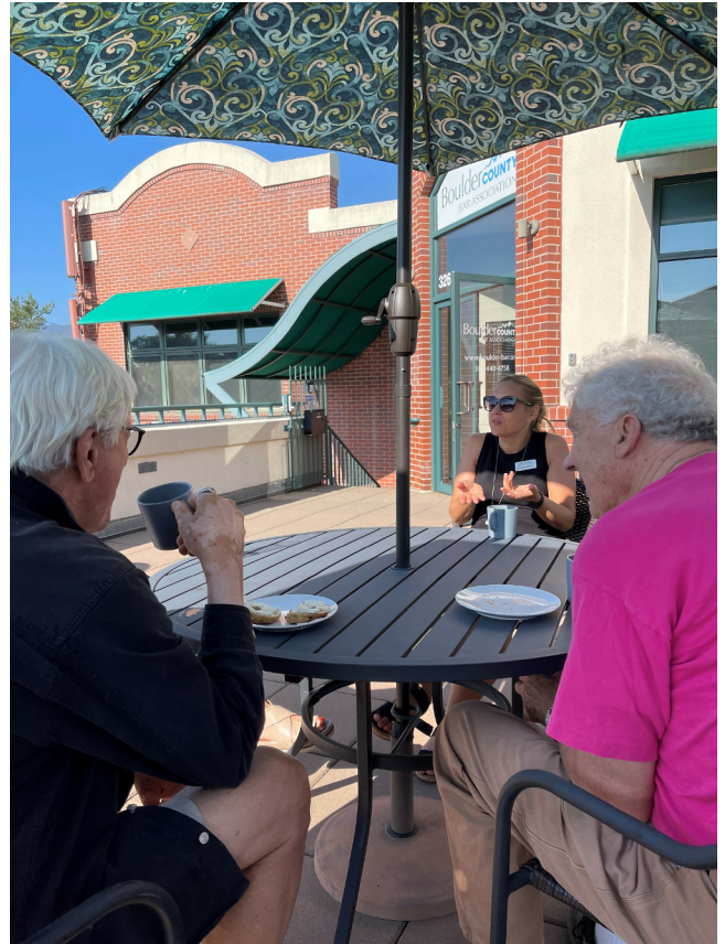
BAGELS WITH THE BAR - EVERY WEDNESDAY AT THE BCBA OFFICE (8-10 AM)