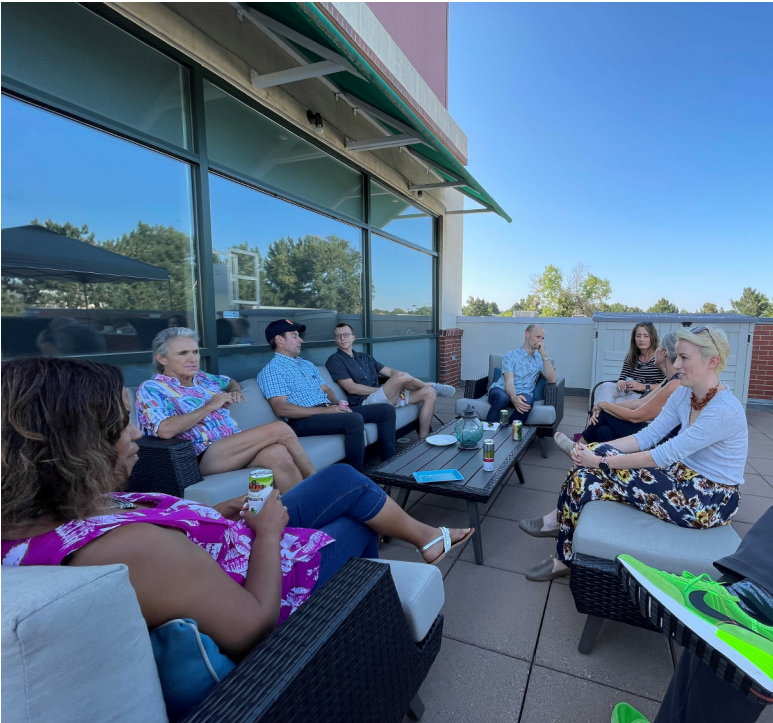
BCBA SOFTBALL POSTSEASON HAPPY HOUR