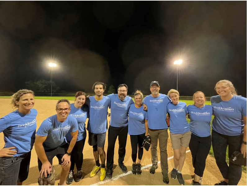
BCBA SUMMER SOFTBALL BLUE TEAM-BAD NEWS BARRISTERS IS DEFEATED 12-9 IN THEIR FINAL PLAYOFF GAME FINISHING THEIR SEASON 0-14