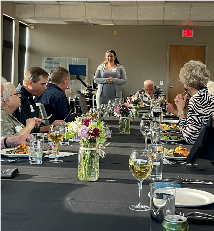
BCBA PAST PRESIDENTS DINNER