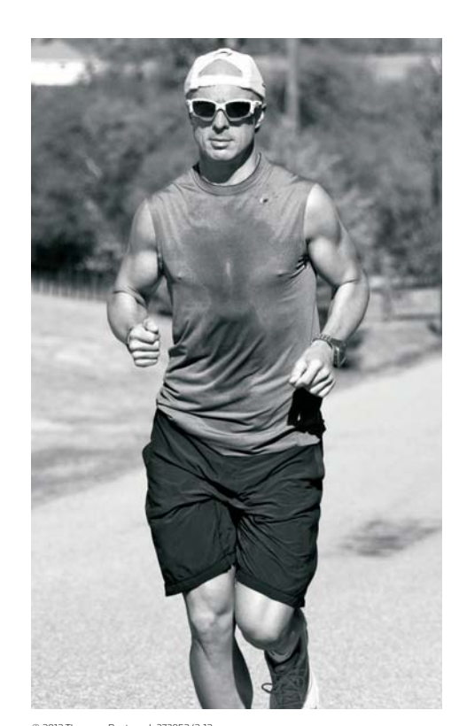
© 2012 Thomson Reuters L-373852/2-12 Thomson Reuters and the Kinesis logo are trademarks of Thomson Reuters.